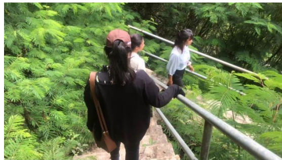
Figure 1. Accessibility to Togatorop Monument in Simatupang Village

The Togatorop Monument is a monument that symbolizes one of the descendants or children of the Simatupang clan. This monument was built in 1973 and inaugurated in 1978. The Togatorop monument has 13 undur-undur or circles which means that when this monument was built, the oldest Togatorop clan was the 13th generation. At the bottom there is a large circle which means the success of the children of the Togatorop clan. At the very top of the monument there is a gold image called "Sipolpon Gold" which was given to a girl named Nababan.