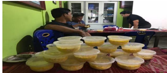
Figure 3. Jasuke as a Product of Simatupang Village

With natural products, people can make special products or foods that can become a characteristic of the village. Natural products such as corn can be a food product that is quite popular, such as Corn Milk Cheese or better known as JASUKE. There are many other potential natural products that have not been optimized. This product can become one of the MSMEs in Simatupang Village which has the potential to improve the economy of Simatupang Village and also the village community.