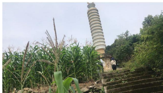
Figure 2. Corn farming land around the Togatorop Monument

One of them is at the Togatorop Monument. Access to the Togatorop Monument in the form of a ladder is not visible because it is covered with many wild plants that grow in abundance and height around the stairs leading to the monument and there are no signs leading to the monument. Around the monument there is also a lot of rubbish strewn about and there are no trash bins available and there are also corn farming fields surrounding the monument.