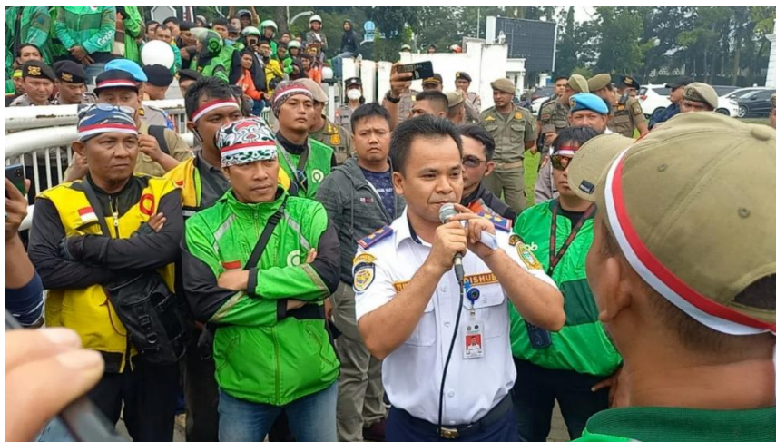
Figure 1.2

Informal workers are categorized as BPU (Not Wage Recipients). Not Wage Recipients is a term often used in the Workers' Welfare Guarantee Institution in Indonesia, namely BPJS Employment. The risks that occur do not only occur to Wage Recipients or those who are paid or paid by the Company, but also informal sector workers such as farmers, fishermen and those we often see in the city of Medan, namely Online Motorcycle Taxis and Parking Attendants. Online motorcycle taxis are independent workers, who often seek sustenance and are also an important aspect in the mobilization of life in the city of Medan. They are vulnerable to risks that may occur in their work. The number of online motorcycle taxi workers is currently very large working on the Gojek, Grab, Maxime, Indrive and other platforms. Not once or twice, but these motorcycle taxi groups often urge and hold demonstrations so that the Medan City Government hears their complaints and employment rights.