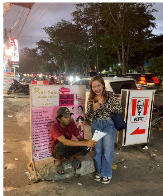
Figure 4.1 Parking Attendant Interview

We have interviewed several non-wage workers around Medan City, and the results of our research are to answer how the Implementation of BPJS Employment Policy in Improving the Welfare of Informal Workers in Medan City. And the following are the results of our interviews and data recapitulation.