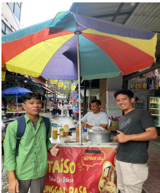
Figure 3.1 Taiso Craftsman Interview

The social environment in Medan shows that the majority of informal workers still rely on daily income, so paying monthly contributions is seen as an additional burden. Economically, income fluctuations deprive them of prioritizing social security. Furthermore, while the political and regulatory environment has supported the implementation of the BPJS Employment program, it still faces numerous challenges, such as the level of awareness and ability of informal workers to participate in BPJS Employment.