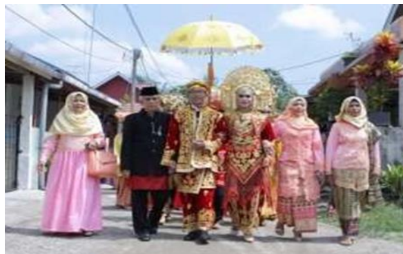
Figure 7. Proses Adat Baralek Custom Process

Baralek events in nagari Tabek Patah are not much different from the baralek events that we encounter in nagari other countries. However, there is a unique culture and customs that are applied in nagari Tabek Patah in every baralek event, be it family baralek or baralek nagari baralek. The rule is that women who will attend baralek are only allowed to wear kuruang clothes. In other words, clothes that we usually encounter at parties such as robe, dress, and dress are not allowed. This kuruang basiba shirt is a typical Minangkabau traditional dress that is considered a sign of identification and identity of minang women. If this rule is violated, the datuak of the woman concerned will be fined by the nagari and will indirectly humiliate kaum their own people. It is implemented by the government of nagari Tabek Patah aims to preserve the distinctive culture and customs of Minangkabau. It is also to guard kaum the women and educate them to dress modestly as taught by the religion of Islam. In addition , the purpose of the use of kuruang basiba clothes kuruang basiba is to preserve the culture and customs that have been passed down from their ancestors.