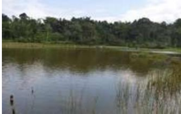
Figure 4. Talago Pakih

cultivate vegetables. There is a path to The Hill peak Pela is yang made by residents to get to the farm. When we reach the peak, will be seen the natural beauty of nagari Tabek Patah along with Talago Pakih in below.