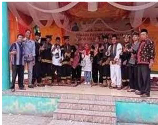
Figure 6. Additional Speech Groups