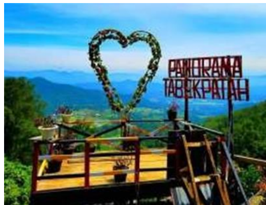
Figure 3. Panorama Tabek Patah

Tabek Patah Panorama Tour is one of the most visited tourist attractions in Tanah Datar Regency. This tourist spot is located at the height of Mount Merapi with cool natural scenery such as a long stretch of hills with lots of green pine trees, the height of the location is suitable for photographing contemporary places. in the form of a tree house and an observatory column with a pattern of symbols of love. Not only that, panorama Tabek Patah is suitable as a place to rest and relax while on vacation. One way to attract tourists to the area is to provide a “hammock” to relax and enjoy the scenery around. In addition to enjoying the hammock tour, visitors can also enjoy the attraction of floating bicycles from a height of about 7 to 10 meters and enjoy spot foto yang Instagrammable photo spots. In addition, the management has also provided several supporting facilities such as booths, spot selfie spots and tree houses for all tourists to enjoy for free (Wati, 2022).