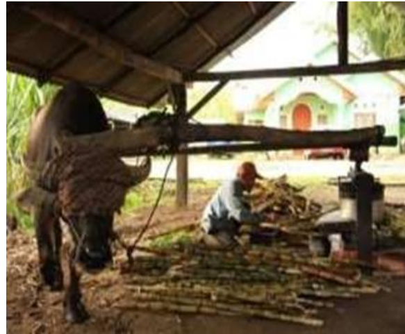
Figure 7. The Process Of Eliminating Taboos