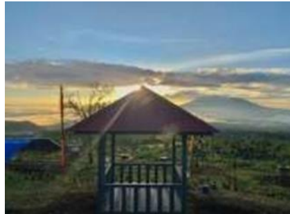
Figure 2. Panorama Stone Panorama