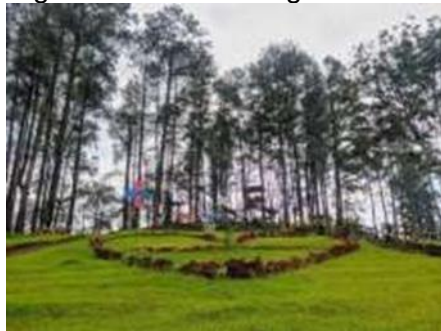
Figure 1. Tree House

Tabek Patah Tree House is one of the tourist destinations of concern to tourists who visit with its uniqueness. Located in Jorong Bukik Decision Tabek Patah District Salimpaung Tanah Datar West Sumatra. This attraction began operating from 2015, has an area of approximately 4 hectares. This tree house is made in the cliff area which is overgrown with pine trees pinus so that this tour feels so cool. This tree house tourist is supported by very adequate road suggestions because it can be passed by wheeled and four-wheeled vehicles. Other facilities and infrastructure around this tree house are in the form of colorful parks, mushalla, toilets, and stalls selling food and drinks and adequate parking areas are available. This tree house consists of three lined tree houses built on Pineland. To visit this attraction is not expensive only charged Rp. 5.000. the advantages of this tree house tourist attraction is where tourists directly watch the natural panorama around the very special and make the eyes can freely see far in the natural mountains that exist around the city of Batusangkar. In addition, the resulting tourist photos will also be very impressive, because the tree house attraction is one of the photo backgrounds that are in great demand by all ages.