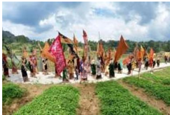
Figure 5. Long Cloth Parade Activities

In a series of events parading 1000 kain long cloth, there is an event called Kato sambah pasambahan between niniak mamak from each family that is from the party that drove to the party that awaits the arrival of prospective children daro. Sambah pasambahan event is divided into 4 parts, namely: