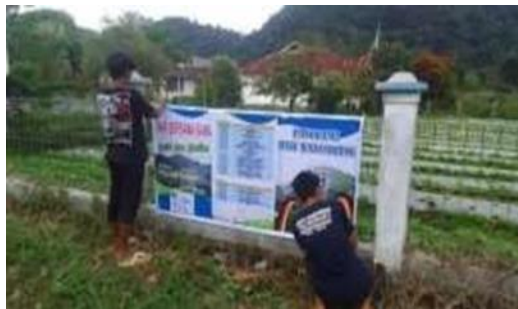
Figure 8. ( Personal Documents, 2023)

The use of banners that are installed on the edge of the road leading to tourist attractions aims to provide information to people who pass through it about tourism Tabek patah. With banners installed along street corners will make people interested to see the tour.