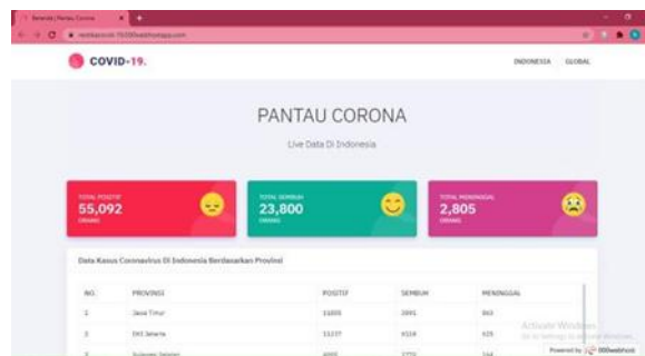
Figure 1 Global Menu View

The design results for this web-based COVID-19 monitoring information system encompass three main aspects: logic design, interface design, and database design. Logic design is carried out to structure the entire system, starting with a UML (Unified Modeling Language) diagram as a visual representation of the system's process flow. Use case diagrams are used to understand the logic and functions carried out by the web-based COVID-19 monitoring information system, especially for users who can access information online regarding the number of positive patients, recoveries, and deaths in real-time.